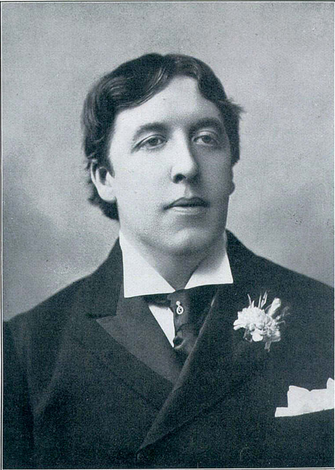
Abb. 289. Oscar Wilde.

A virtual lecture on the last days in the life of Oscar Wilde.