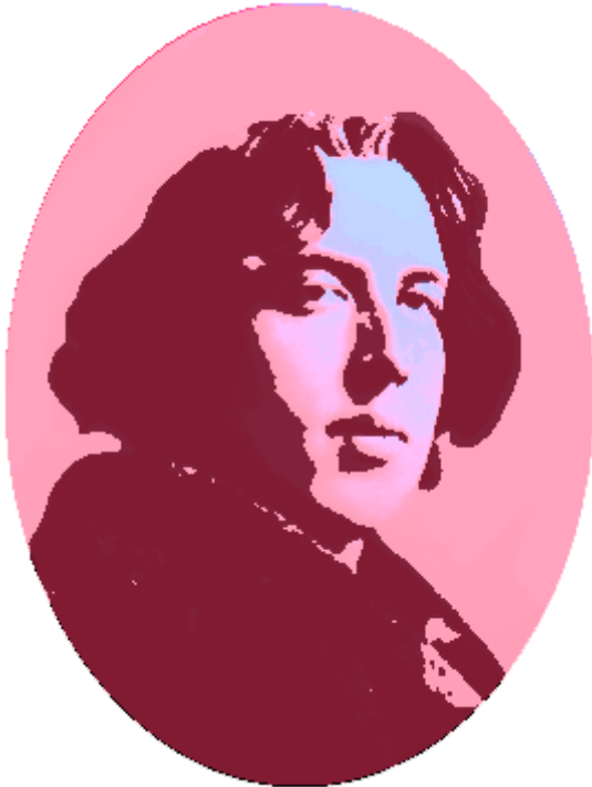
Oscar Wilde