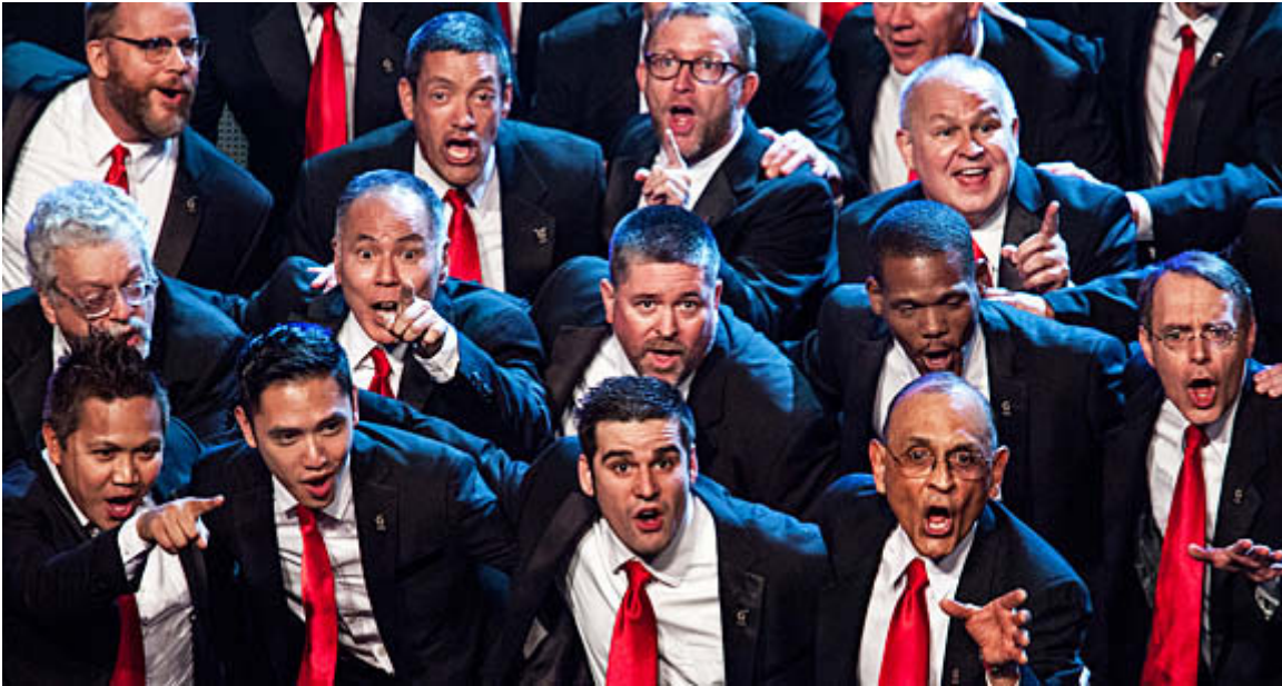
L.A. Gay Men's Chorus