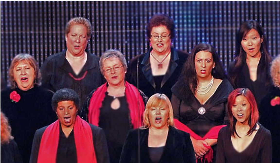
Vox Femina, L.A.